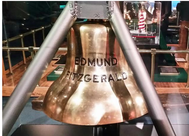
Restored Fitzgerald bell – Great Lakes Shipwreck Museum

My wife and I recently returned from a Viking cruise on the Great Lakes. Throughout our voyage the Lakes were calm and the weather perfect.