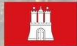
Hamburg June 17, 1790