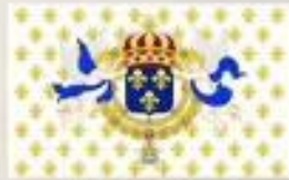
France February 6, 1778