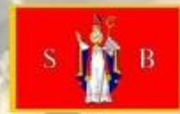
Ragusa July 7, 1783