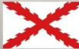
Spain February, 1783