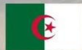
Algeria September, 1795

Revolutionary War History Corner: The First Countries to Acknowledge the Independent United States!