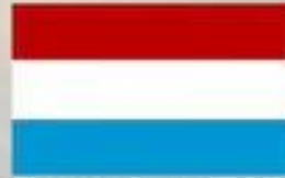
Netherlands April 19, 1782