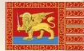
Venice August, 1783