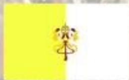
Papal States December, 1784