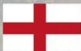
Genoa October, 1791