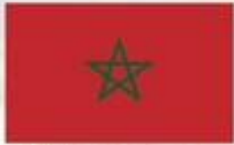
Morocco June 23, 1777