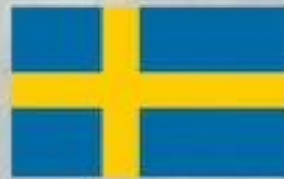
Sweden April 3, 1783