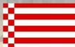
Bremen May 28, 1794