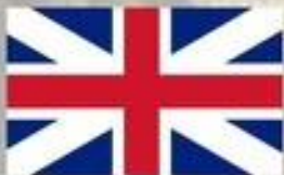
Britain September, 1783