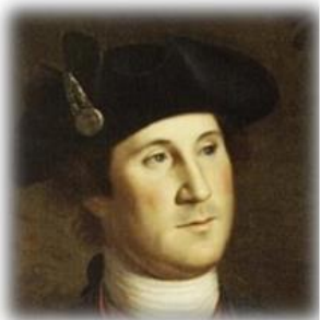
Col. George Washington