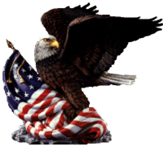
UNIFORMS OF THE AMERICAN REVOLUTION

The rifleman shown here clad in a green hunting shirt was a unique American contribution to the science of warfare in the Eighteenth Century. His weapon was the long rifle developed by the Pennsylvania gunsmith from the short, heavy European rifled gun. This rifle was intended to be used at a range far greater than the usual smoothbore musket. It enabled the marksman to select his target, rather than to blindly fire at a mass of men. The success of this tactic was quite disturbing to the British.