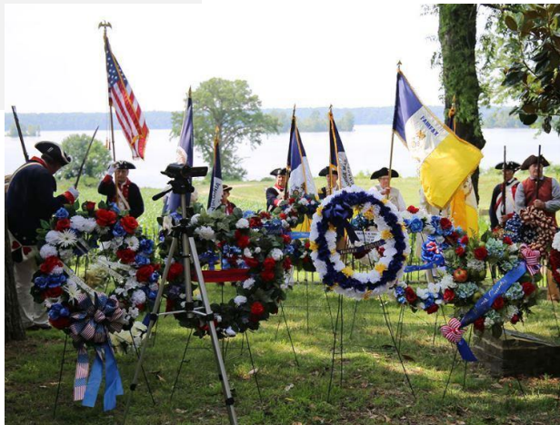
Presentation of Wreaths