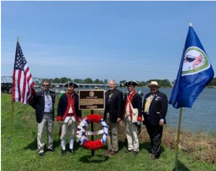
VASSAR officers presenting VASSAR wreath