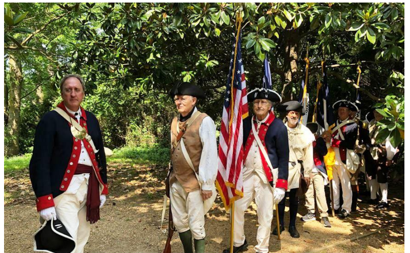
VASSAR Color Guard