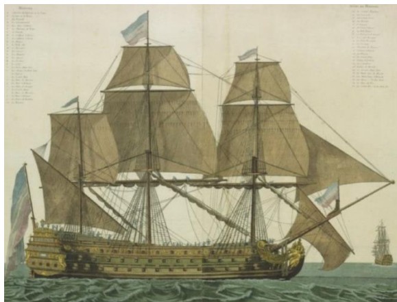
Admiral Comte de Grasse flagship Ville de Paris