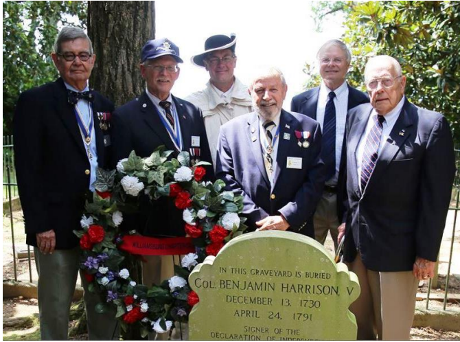
Williamsburg Chapter Officers